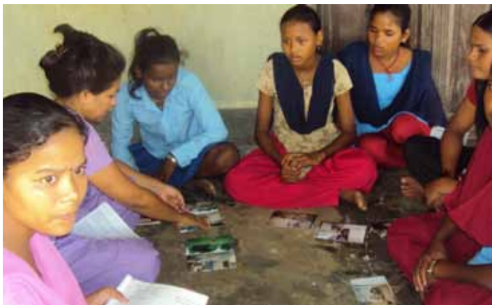
Girls discuss the photos they took portraying what life is like for boys and girls in their community. This technique is called Photovoice.