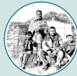
Side Effect Puzzle