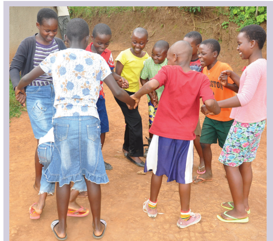
Girls and boys, ages 10-14, play interactive games designed specifically for VYAs.

IRH stands ready to assist the MOH and partners in implementation and evaluation of adolescent sexual and reproductive health strategies that move Rwanda's policies into action.